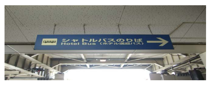
Figure 7. Hotel Shuttle Bus Stop Direction Sing