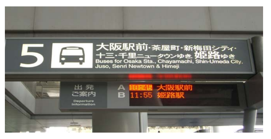
Figure 2. Bus Stop #5 for Airport Limousine Bus to Osaka Station