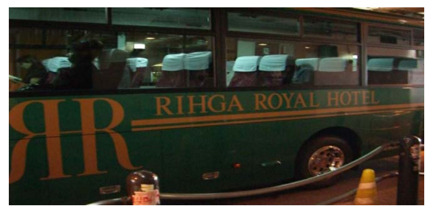
Figure 8. Rihga Royal Hotel Shuttle Bus