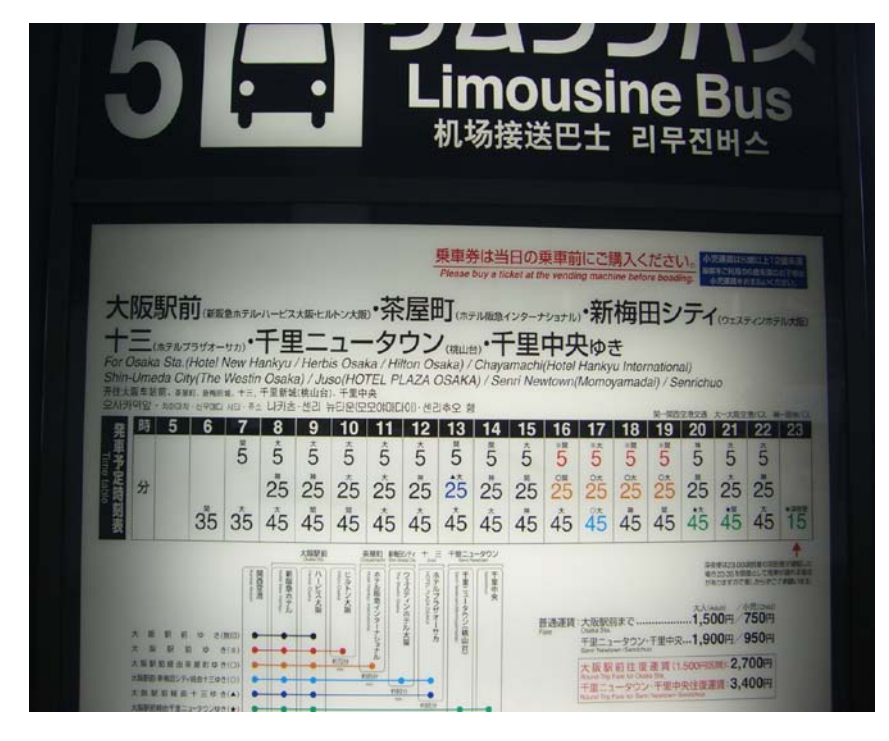
Figure 3. Limousine Bus Schedule from Kansai Airport

3. Kansai Airport Limousine Bus (Figure 4) runs from 6:35. From 08:05, it runs every 20 minutes till 22:45. Figure 3 shows the daily timetable. One-way fare is 1,500 Yen and round-trip fare is 2,700 Yen. It is slightly more expensive compared to 1,160 Yen for Train. Bus tickets can be purchased using automated ticket machine behind the Bus Stop #5 (see Figure 5).