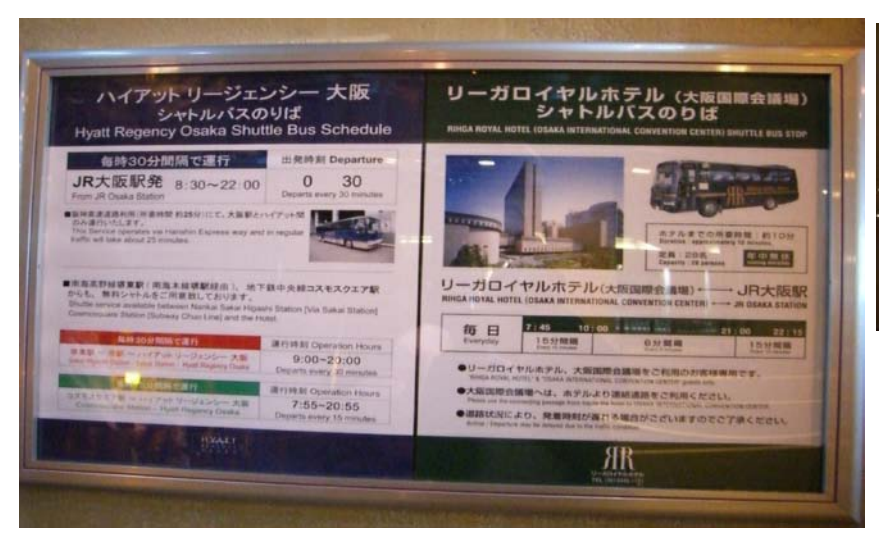
Figure 9. Rihga Royal Hotel Shuttle Bus Stop (right side)