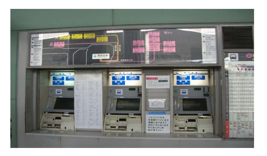
Figure 5. Bus ticket machine