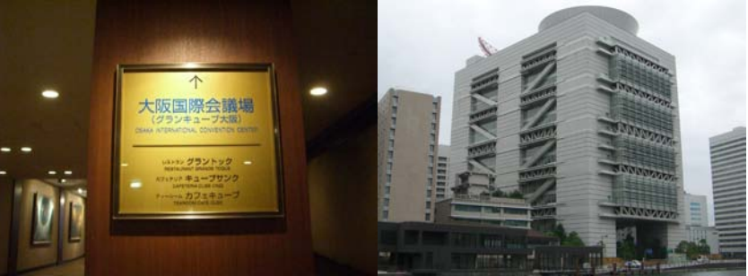
Figure 10. Hotel Lobby to GCO