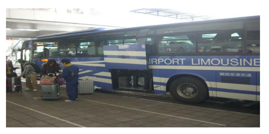
Figure 4. Airport Limousine Bus

3. Kansai Airport Limousine Bus (Figure 4) runs from 6:35. From 08:05, it runs every 20 minutes till 22:45. Figure 3 shows the daily timetable. One-way fare is 1,500 Yen and round-trip fare is 2,700 Yen. It is slightly more expensive compared to 1,160 Yen for Train. Bus tickets can be purchased using automated ticket machine behind the Bus Stop #5 (see Figure 5).